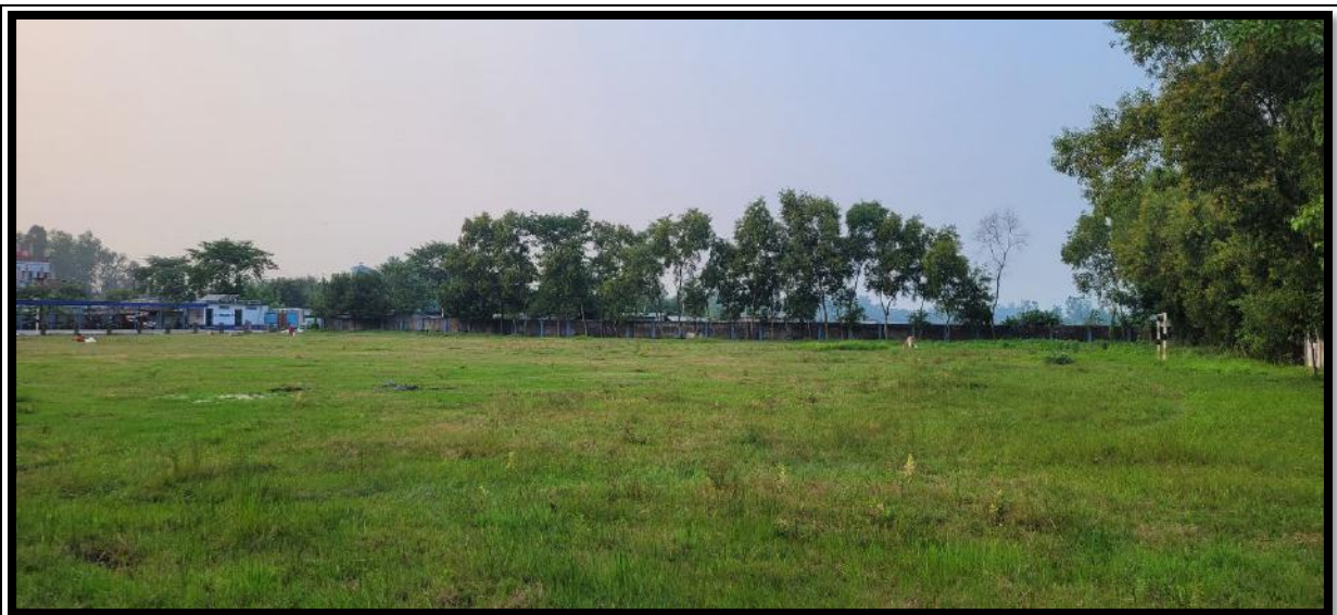
Playground of Buniadpur Mahavidyalaya, which not only serves a space for activities of the college, but also supports the ecology.

Encourage participation from the students at the institution, faculty and staff in the upkeep and preservation of the greenery. Volunteer programmes, instructional workshops and awareness campaigns are all excellent avenues for accomplishing this goal. A wide variety of plant and animal species can thrive on grasslands. Greenery encourages biodiversity on campus by serving as a habitat for various plant and animal species, thereby contributing to the maintenance of ecological equilibrium. Greenery can remove carbon dioxide from the air and store it in their soil, which contributes to the fight against climate change by lowering overall levels of greenhouse gases.