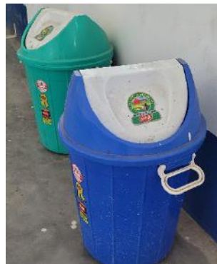
Waste Bins (bio-degradable & non-biodegradable)

4.2.2. Composting: The institution has a composting pit to handle the degradable waste produced by students and staff. Composting can help drastically reduce the quantity of garbage dumped in landfills while also producing compost for gardening. Bio-degradable waste processing plants are present at the college campus, which effectively do the job.