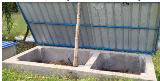
Waste Processing Unit