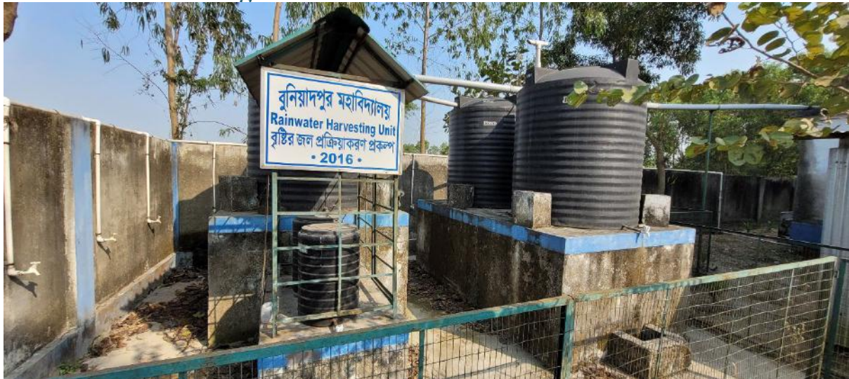
Rainwater Harvesting Unit

Rainwater is collected & stored from raindown pipes of roof in tanks, which is later utilized for purposes other than drinking.