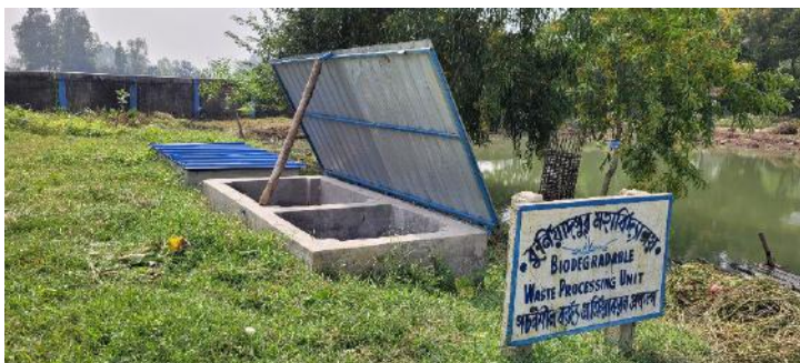
➔ Waste Processing Unit