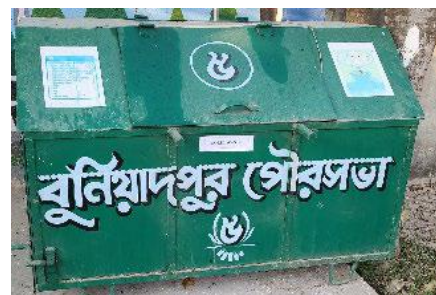
Municipal Waste Collection Bin