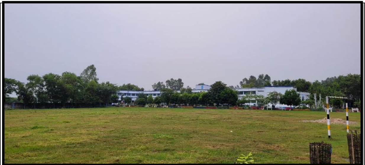
Playground of Buniadpur Mahavidyalaya, which not only serves a space for activities of the college, but also supports the ecology.

Encourage participation from the students at the institution, faculty and staff in the upkeep and preservation of the greenery. Volunteer programmes, instructional workshops and awareness campaigns are all excellent avenues for accomplishing this goal. A wide variety of plant and animal species can thrive on grasslands. Greenery encourages biodiversity on campus by serving as a habitat for various plant and animal species, thereby contributing to the maintenance of ecological equilibrium. Greenery can remove carbon dioxide from the air and store it in their soil, which contributes to the fight against climate change by lowering overall levels of greenhouse gases.