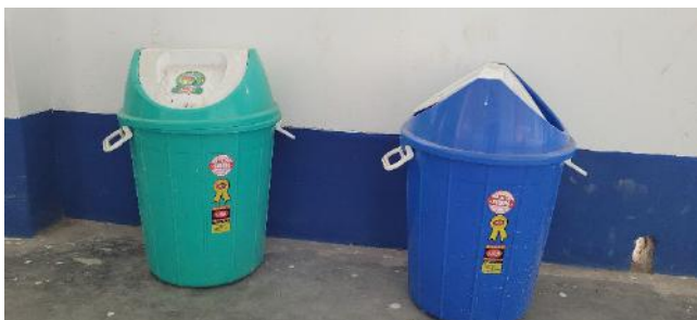
Waste Bins (bio-degradable & non-biodegradable)

4.2.2. Composting: The institution has a composting pit to handle the degradable waste produced by students and staff. Composting can help drastically reduce the quantity of garbage dumped in landfills while also producing compost for gardening. Bio-degradable waste processing plants are present at the college campus, which effectively do the job.