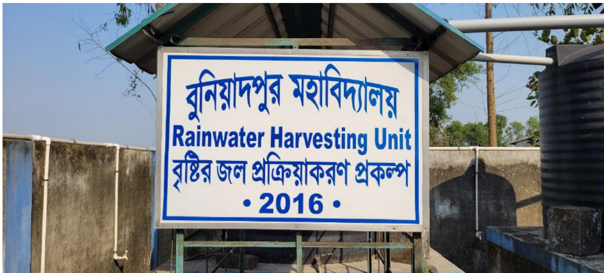
Rainwater Harvesting Unit

Rainwater is collected & stored from raindown pipes of roof in tanks, which is later utilized for purposes other than drinking.