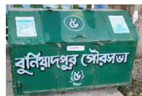
Municipal Waste Collection Bin