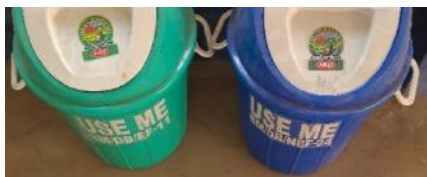
Waste Bins (bio-degradable & non-biodegradable)

4.2.2. Composting: The institution has a composting pit to handle the degradable waste produced by students and staff. Composting can help drastically reduce the quantity of garbage dumped in landfills while also producing compost for gardening. Bio-degradable waste processing plants are present at the college campus, which effectively do the job.